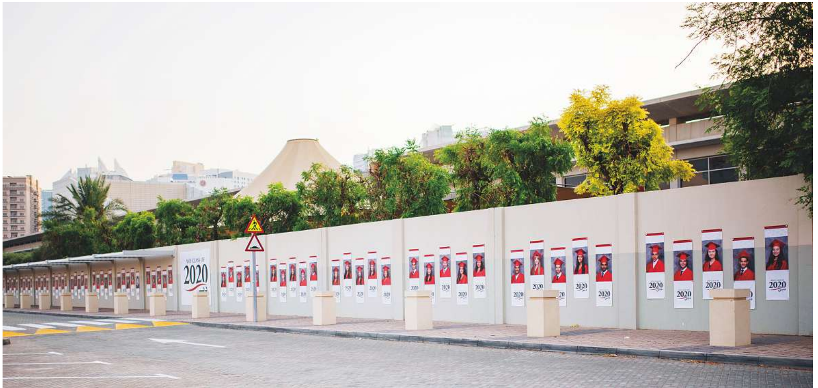
● American School of Dubai's Wall of Graduates to honour the Class of 2020

O n Monday, the American School of Dubai (ASD) recognised students who have made significant contributions to the school community. The Senior Awards is an annual event to celebrate student excellence in the areas of academics, arts, athletics, service and leadership.