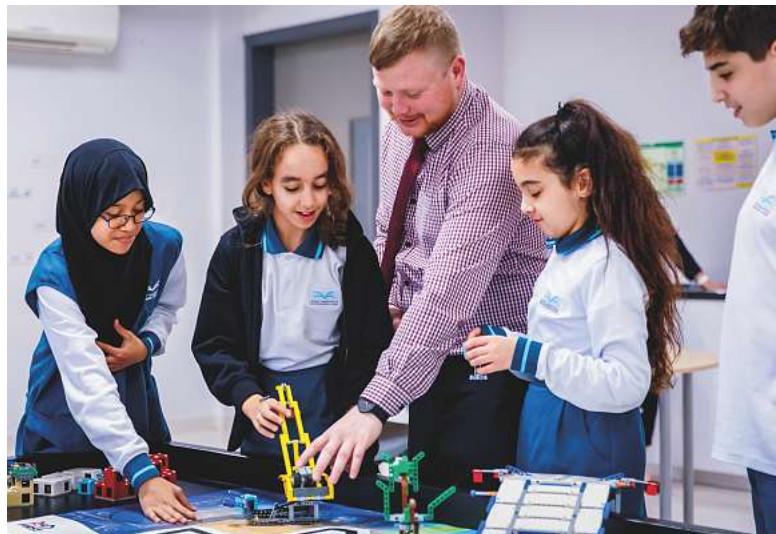
● Liwa International School – Al Mushrif

During these challenging times, Liwa Education aims to deliver effective continuation of learning for its students. Liwa Education's Distance Learning pillars were quickly established and became the basis of its implementation plan. Its E-Learning policy has a very clear