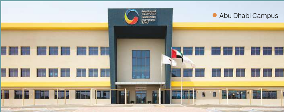
● Abu Dhabi Campus