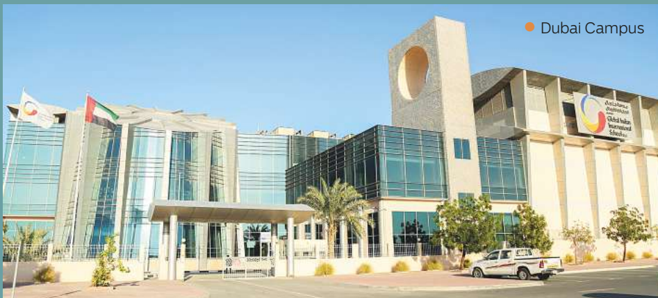
● Dubai Campus